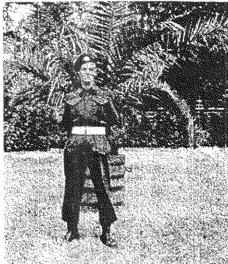
Here is the chap responsible for the weekly cartoon, "Boozin' Pals". We owe him much for the diversion his work has afforded.

To all these swell people we wish "all the best" and good luck in any and all of your future undertakings. (providing they are above board.)